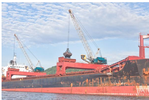
Coal being unloaded at the former Dynege Plant

The 530-megawatt power plant Danskammer plant built by Central Hudson Gas & Electric Corp. in the 1950s was one of the worst polluting plants in the state. Its coal-fired operation produced more than 1 million pounds of emissions yearly along with ash and other by-products.